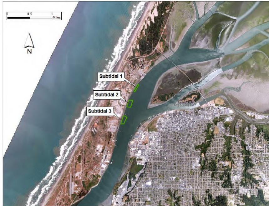
Figure 2. Recently approved sub-tidal areas that are nursery sites for seed production. Currently Hog Island Oyster Company and Taylor Shellfish utilize these sites

The six businesses that operate on Humboldt Bay represent a variety of business models, which are linked to different phases in shellfish production. Generally, the process of shellfish production as it is conducted in Humboldt Bay can be broken down into four broad phases.