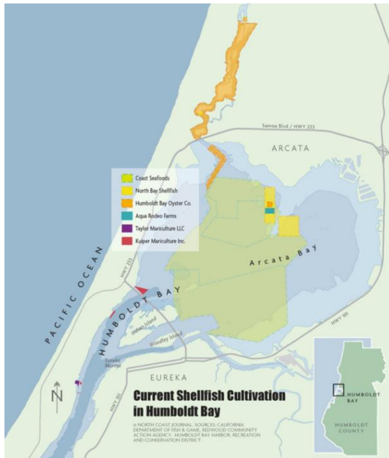
Figure 1. Map of Humboldt Bay Shellfish production areas as of 2012. The colored areas represent lease blocks and not all colored acres are under cultivation. Kuiper Mariculture Inc. was purchased by other businesses operating in the Bay.

Services, 2007). Shellfish production has been a part of Humboldt Bay since time immemorial as the Wiyot people were known to harvest and consume shellfish in the bay (Walters, 2012). Commercial shellfish sales in the bay dates back to 1854 when L.K. Wood began selling clams gathered from the bay. The first documented attempt to grow oysters in the bay was in 1897 (Coy, 1975). Currently mariculture production in Humboldt Bay includes four species: Kumamoto oysters ( Crassostrea sikamea ), Pacific oysters ( C. gigas ) and to a lesser degree Manila clams ( Tapes philippinarum ) and mussels ( Mytilus galloprovincialis ) (HBHD 2015). There are currently six different businesses operating in the Humboldt Bay shellfish mariculture sector. Maps of the locations of leased tidelands for these businesses can be found in Figures 1 and 2.